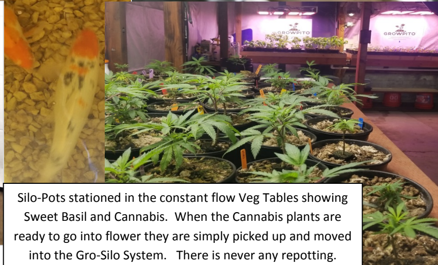
Silo-Pots stationed in the constant flow Veg Tables showing Sweet Basil and Cannabis. When the Cannabis plants are ready to go into flower they are simply picked up and moved into the Gro-Silo System. There is never any repotting.