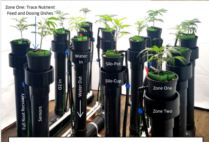
Gro-Silo System with 12 plants for a 20 sq-ft area